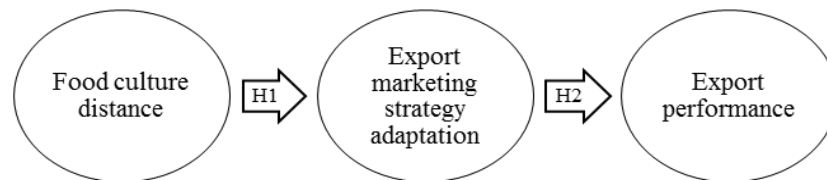
Figure 1. The Conceptual Framework

Building on conceptual models proposed in previous international marketing research (Cavusgil et al. 1993; Cavusgil and Zou 1994; Ozsomer and Simonin 2004), the conceptual framework postulates that a food company's export performance is influenced by the extent to which its export marketing strategy has been adapted, which per se is influenced by the food culture distance between the firm's home and export markets (Figure 1).