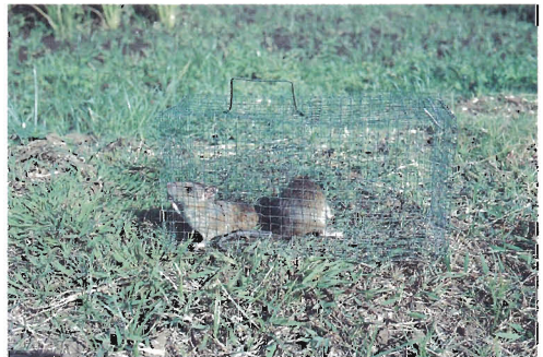
Plate 3. Wire live-capture traps with conical entrances are used in Malaysia, Philippines and Indonesia.