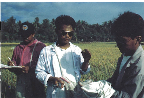
Plate 4. Processing of rats for information on their demography and breeding condition, Luzon, Philippines.