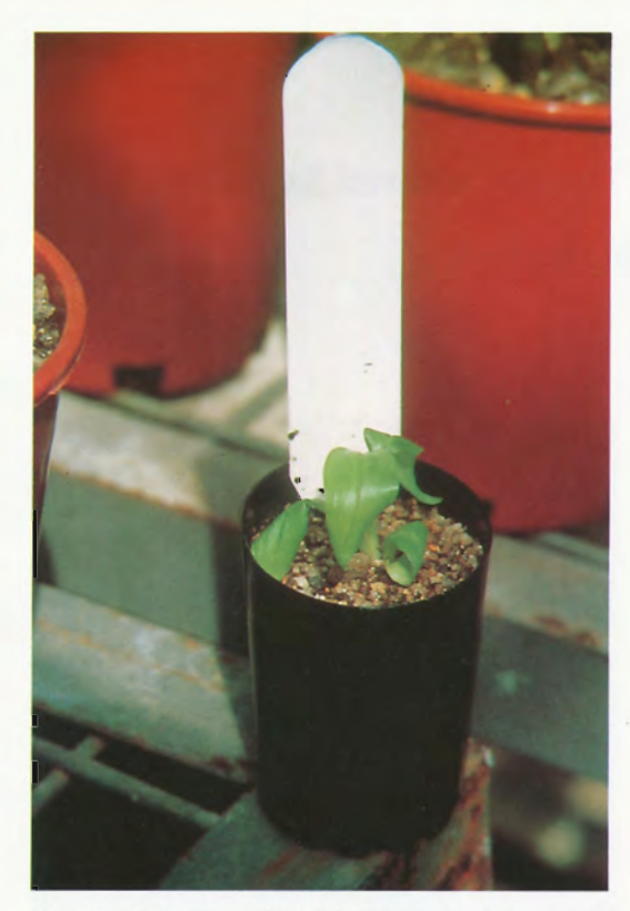
Plate 2 Recently deflasked tissue culture plants in 5 cm pot.

cultured plants is usually poorly developed and the stomata are not functioning properly hence the need for special attention. Also the roots developed by tissue-cultured plants are inefficient at taking up water and remain so for several days after transfer. For these reasons recently transferred plants can become water stressed when the relative humidity remains below 90%.