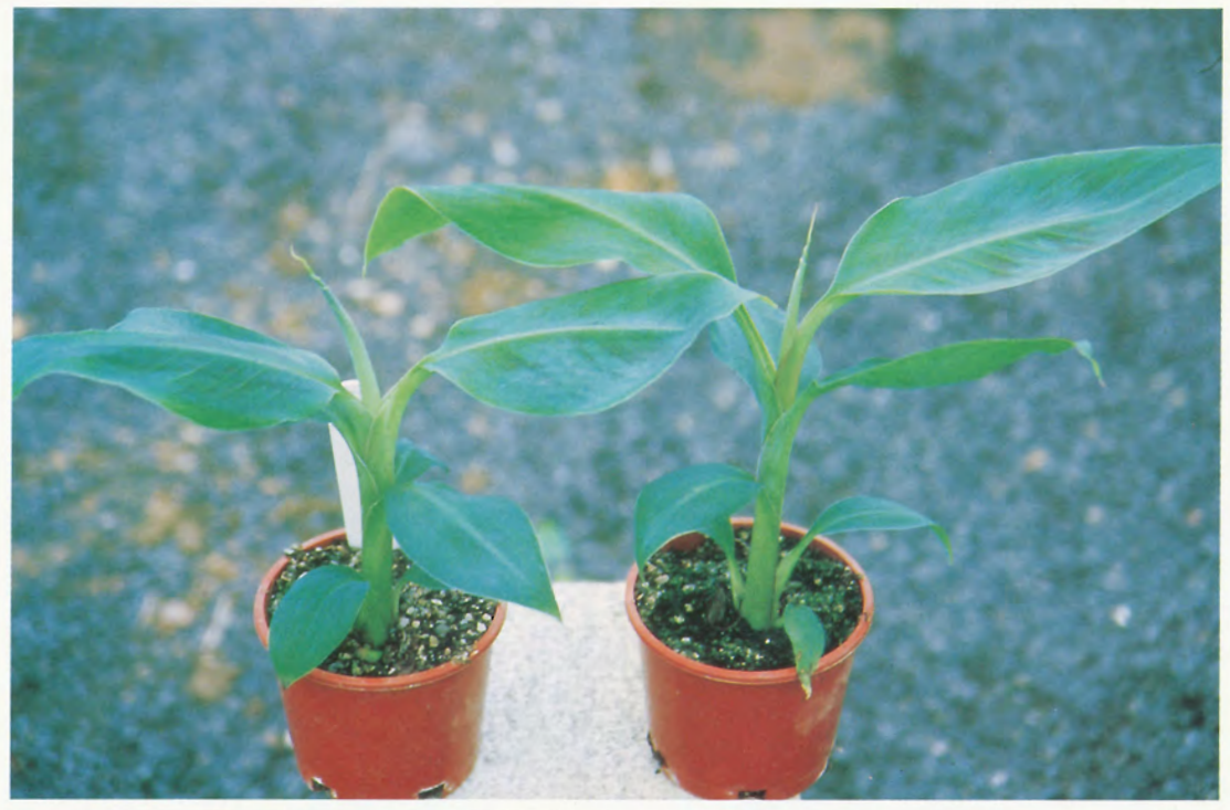
Plate 17 Tissue cultured plants ready for field planting. The dwarf offtype is on the left. Note the shorter petioles and shorter internodes and lower leaf ratio of the dwarf.