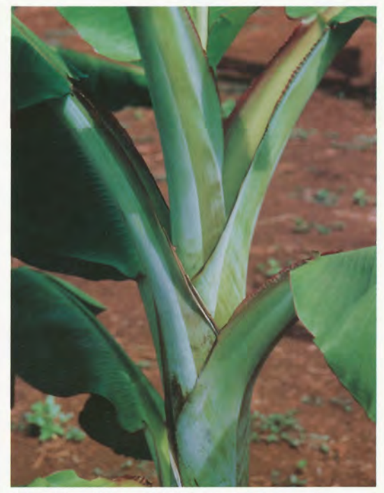
Plate 12 Offtype of TU8 with bicolour petioles and leaf bases.