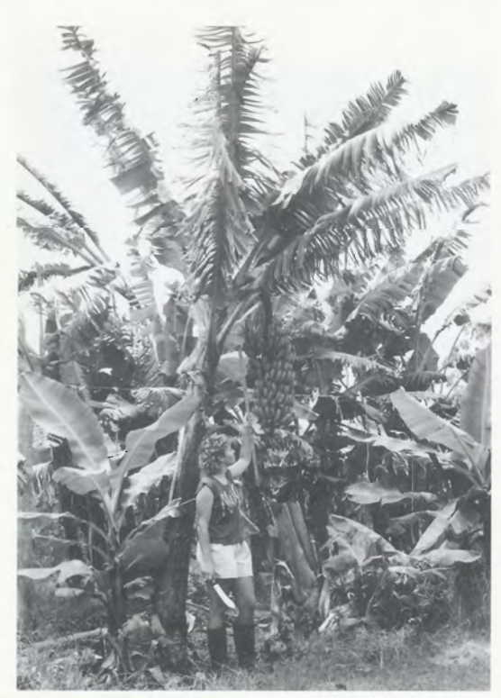
Plate 6 Normal plant.