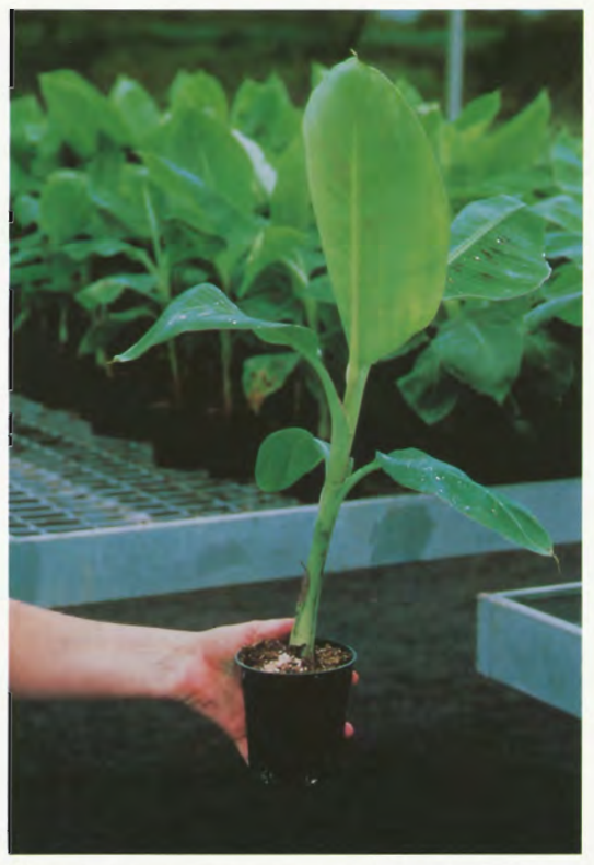
Plate 4 Tissue cultured plant ready for field planting.

Plants are ready for field planting when about 20 to 30 cm tall (Plate 4). Smaller plants can be successfully established in the field but require ideal water management to achieve this. Mechanisation of planting is possible using machinery adapted from that used for transplanting vegetable seedlings. This is better suited to the smaller plants in 5cm pots. Tissue culture plants should be planted in a furrow to prevent the plant's corm from developing too near the surface (Plate 5). Shallow rooted plants are more subject to blowing over. As the plants grow the furrow can be filled