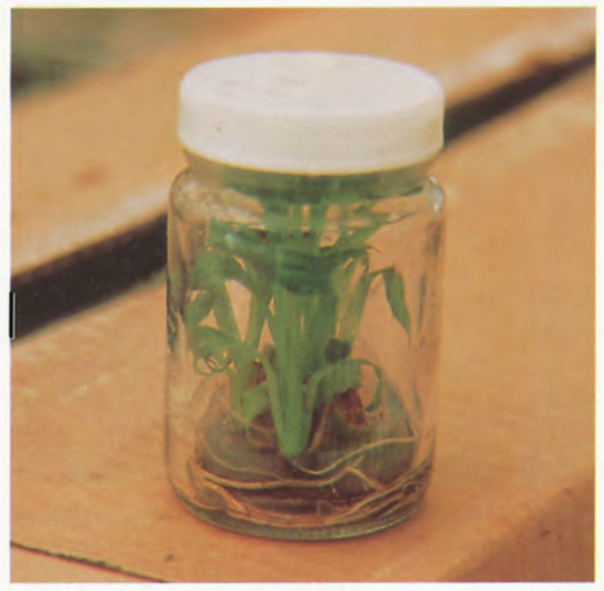
Plate 1 In vitro plants ready for deflasking.

Step 2 The flask contents can then be carefully tipped out and washed under running water to remove the agar. If any agar remains on the plant it can promote infection with pathogens. Older plantlets need to have their longer root systems carefully disentangled.