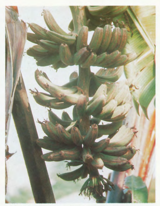
Plate 15 Naturally occurring offtype with severe scarring on the fruit peel.