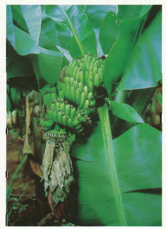
Plate 8 Dwarf offtypes aften exhibit choke throat and retain flowers and bracts.