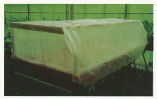
Plate 3 Humidicrib capable of holding about 800 deflasked plants in 5 cm pots.

Step 5 Trays of plants can then be transferred to a humidicrib (Plate 3). This can be constructed by enclosing a frame in strong clear plastic with moist sand in the bottom to maintain high relative humidity. Plants need to be out of full sunlight at this stage. About 60-70% shade over the structure above the humidicrib would be satisfactory. The impact of heat buildup inside a plastic enclosure can be minimized by having a high ceiling (≈1m) to the enclosure. Tubs with plastic