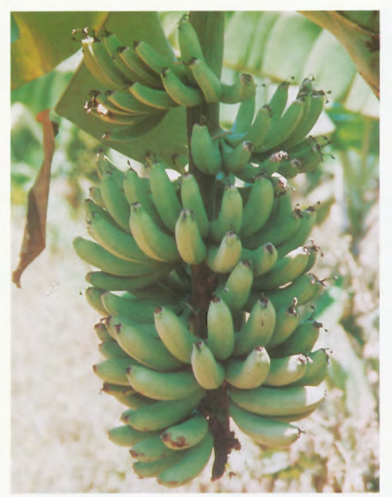
Plate 13 Offtype in which the top 2 hands fail to fill.