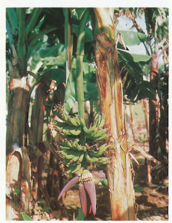
Plate 10 Offtype with long peduncle.