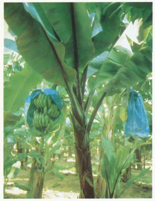
Plate 14 Offtype with black stem and petioles.