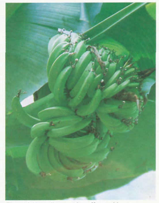
Plate 16 Naturally occurring offtype with an incomplete bunch.