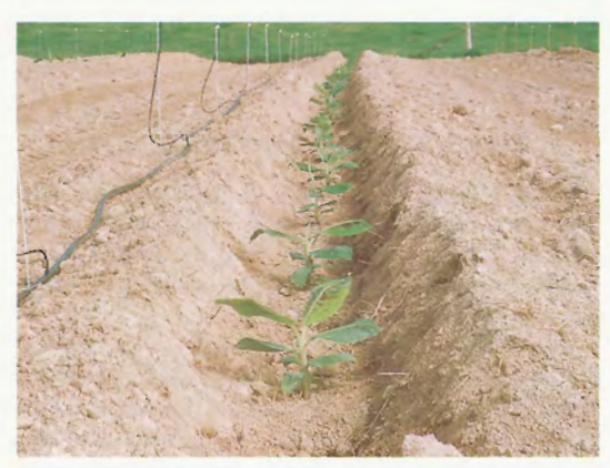
Plate 5 Tissue cultured plants should be planted deeply in the field to prevent shallow corm formation.

mechanically as part of the weed control procedures. Further weed control is best obtained with contact herbicides using hoods on the spray wand to prevent leaf burn. If mechanisation is not possible, plants can be planted in a deep hole and