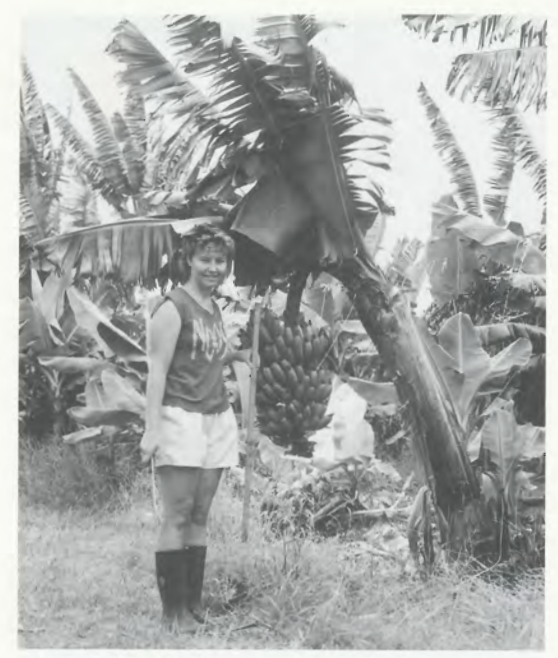
Plate 7 Dwarf offtype.

Management: Most offtypes are of poor quality with limited marketing potential. Most offtypes are readily noticeable following bunch emergence, some earlier. If tissue cultures have been planted for a planting material nursery the offtypes (if undesirable) should be identified and killed before planting material digging/preparation so that they are not multiplied further. To kill unwanted plants cut and inject with kerosene. If a field planting has been established directly from tissue culture then gaps formed by culling of offtypes can be partially filled by retaining more suckers on nearby plants. It is seldom worthwhile to replant misses because competition from older neighbouring plants greatly suppresses their growth. Where offtypes are minimal the crop uniformity possible with tissue culture exceeds that generally possible with conventional planting material (Plate 18).