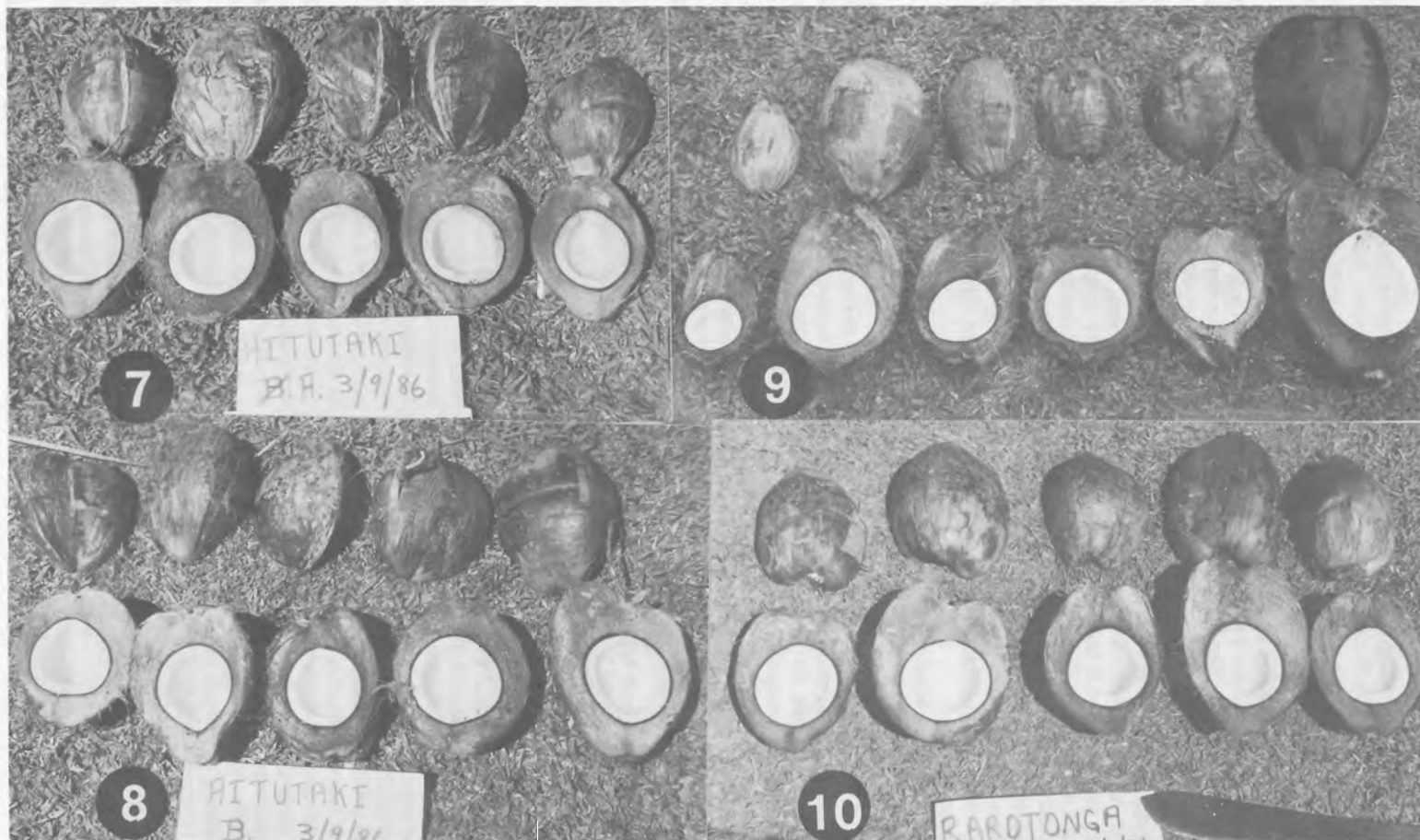
Fig. 1 Cross-section of nuts from sampled areas. 1. Vaiaku islet, Funafuti. 2. Falefatau islet, Funafuti. 3. Niu Ati cultivar from Tutuila, American Samoa. 4. Local Tall (TLT) from A. Samoa, 5. Niu Afa (SNA), Western Samoa. 6. Niu Vai (SNV), Western Samoa. 7. Cook Islands Tall (CIT) from Tapeutai, Aitutaki. 8. CIT from Akaiyami, Aitutaki. 9. Six different cultivars from Rarotonga, Cook Islands: (left to right): Niu Papua, Fiji Green Dwarf, Red Malayan Dwarf, Local Green Dwarf, Red fruited 'solid Dwarf', CIT. 10. CIT, Rarotonga. A uniform scale has been used in this figure so that direct comparison of size between cultivars can be made by eye.