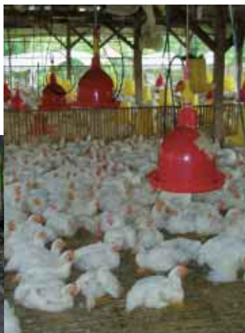
Each contractor has about 2500 birds at any one time.