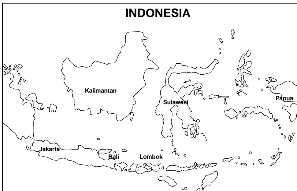
Figure 1. Indonesia and the study area.

Intensive small-scale agriculture is practised throughout the year. In some of the more fertile areas smallholders are able to produce three crops per year. There is, however, increasing pressure on agricultural land from the tourist industry and urban expansion, with large productive areas being purchased for new subdivisions, hotels and recreational use. Decreasing crop land (in particular the irrigated sawah ) and a rising population have led to a demand for increased production. So far, new varieties and greater use of chemicals have improved productivity but the long-term future is uncertain.