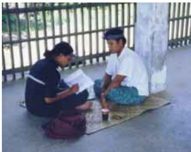
Interviews were carried out with 500 smallholders in Lombok and Bali on a one-to-one basis.