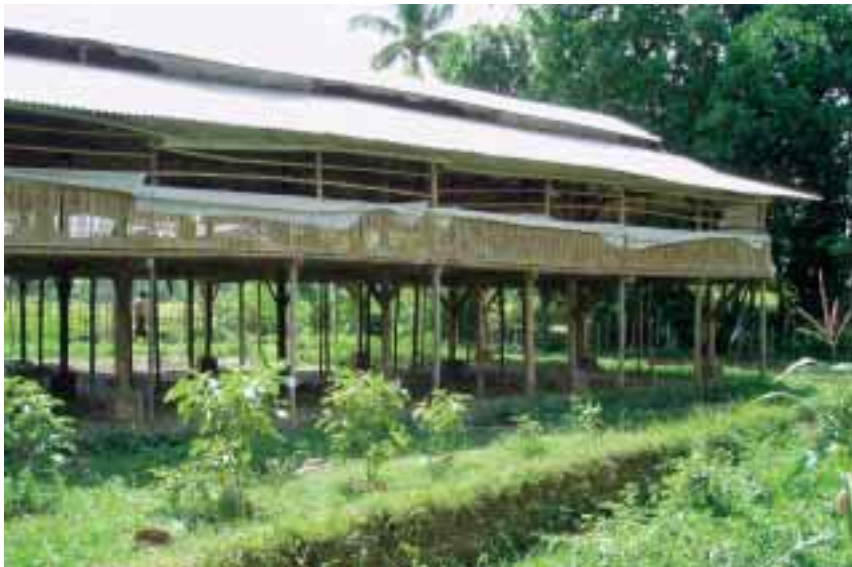
Smallholders provide chicken sheds built to company specifications.

NUJ uses contracts with smallholders to produce around 10,000 broilers per day. It has operated on Lombok since 1998 and since then has carved out a stable market niche for broilers. When the firm was established in Lombok, daily consumption of kampung (village) chickens was around 5000. After five years of competition from contracted broiler production this figure has not changed, indicating strong market