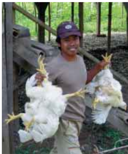
All Lombok broiler production is consumed locally.

There are around 250 smallholders participating in the contract with around 2500 birds each at any point in time giving a total broiler production of approximately 600,000 birds in each cycle of production.