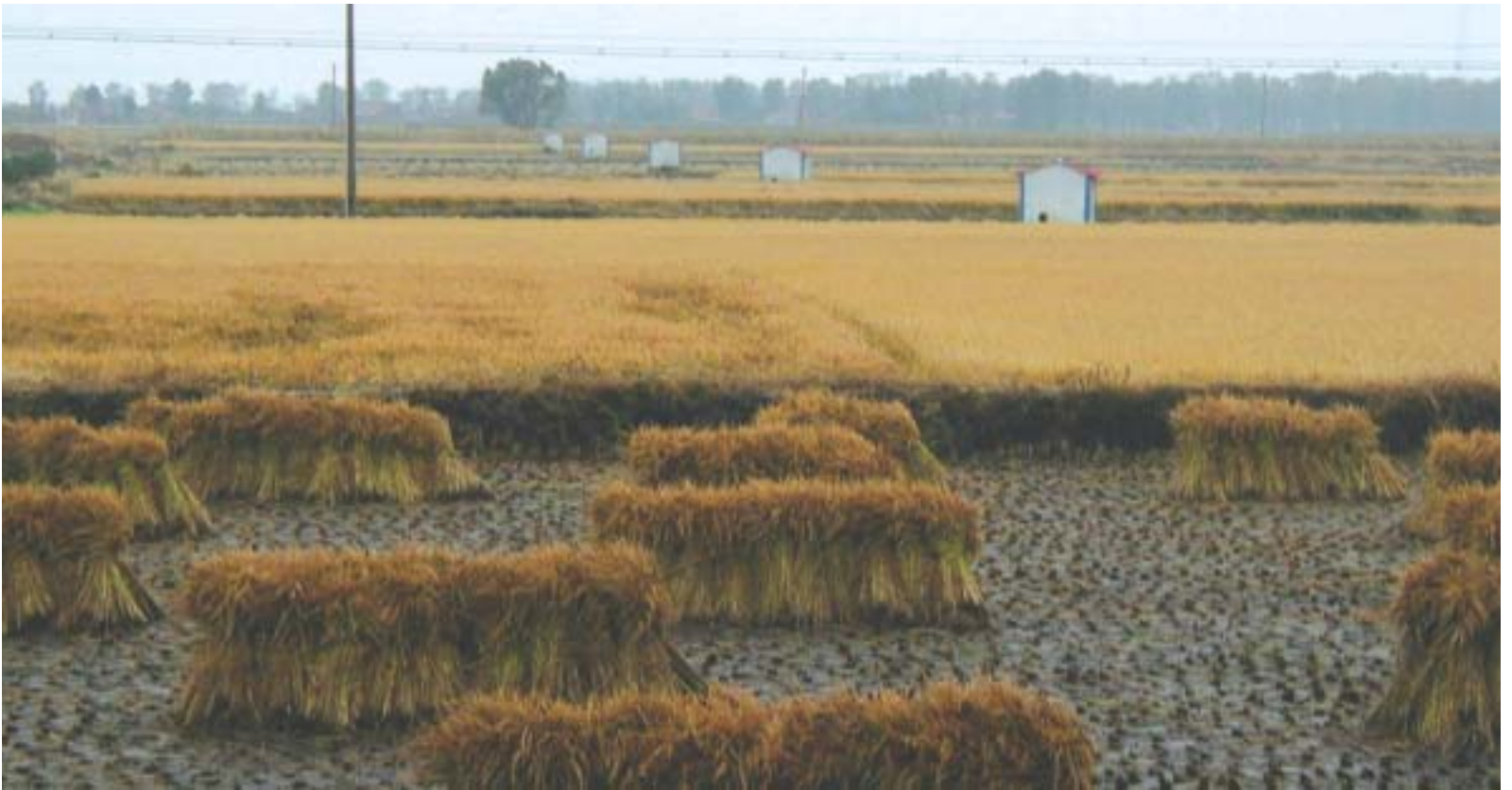
Tube wells in Shenyang, Liaoning Province, China