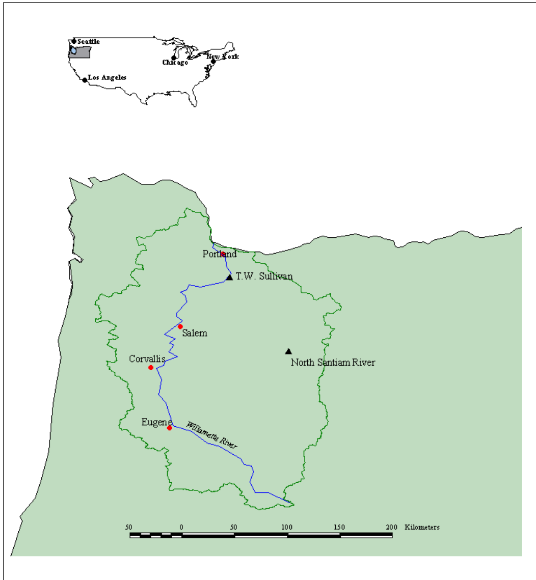
FIGURE 1—Willamette River Watershed