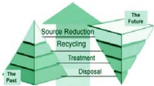
Figure 1. The P2 Hierarchy Figure from www.maine.gov/dep/innovation/p2/whatsp2.htm