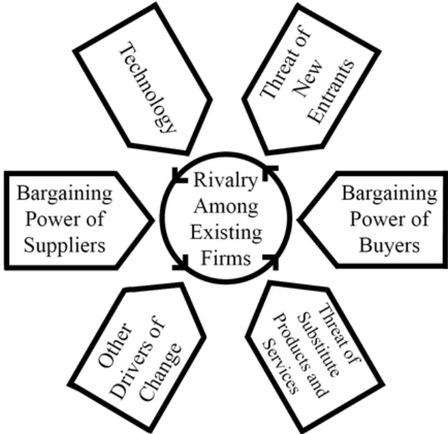
Figure 2: Value Chain for Plants, Animals, and their Products

Figure 2 provides a pictorial summary of the modified Five Forces framework. This framework was used by each of the authors of the articles for this theme to analyze the challenges, opportunities and changes for the various stages of the agribusiness value chain.