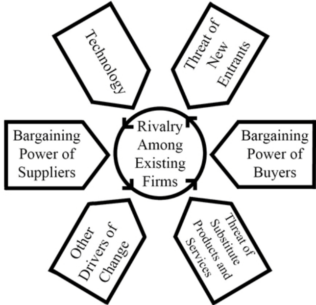
Figure 2: Value Chain for Plants, Animals, and their Products

Figure 2 provides a pictorial summary of the modified Five Forces framework. This framework was used by each of the authors of the articles for this theme to analyze the challenges, opportunities and changes for the various stages of the agribusiness value chain.