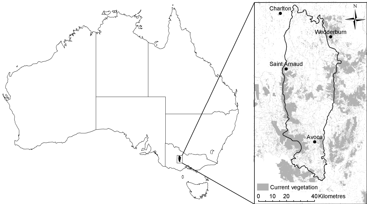
Figure 1. Avoca catchment study area.

summers, cool wet winters, and most rainfall received in winter and spring, although the average varies from 400 mm/yr in the North to 700 mm/yr in the South. The elevation ranges between 100 m in the North and 350 m in the South of the catchment.