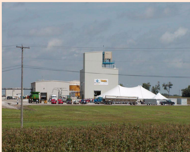
Figure 2. The West Central Biodiesel Facility in Ralston, Iowa, is expected to produce 6 million gallons of biodiesel annually.

Average consumption of gasoline and diesel in Organization for Economic Cooperation and Development (OECD) countries was 900 million tonnes from 1996-1999 (Agriculture and Agri-food Canada, 2002). The United States accounted for the largest share (51%) followed by the European Union (26%). However, considerable differences exist between countries in their use of gasoline and diesel. In the United States and Canada, gasoline accounted for 77% and 72% of the total fuel