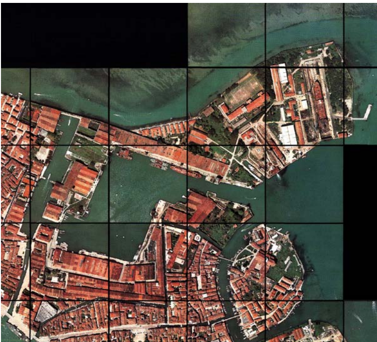
Figure 5: Aerial View of the historic Venetian Arsenal (CIRCE, 2000)

Out of the analysis of the political debate on alternative options for the re-use of the Arsenal two basic alternative directions could be extrapolated. The first one is pointing to installing “poor” functions in the ancient buildings without considering the historic significance of the area, but well compatible with the historic building structures. The functions to be introduced are small artisans activities (carpenters, electricians, masons, etc.) mostly already working within the historic centre but often under menace of expulsion because of pressings from the real estate market. The second option points to the introduction of “new” uses somehow connected to the Arsenal’s historic function, a touristic marina. On the basis of these basic assumptions two hypothetical projects or scenarios have been created in order to evaluate their sustainability.