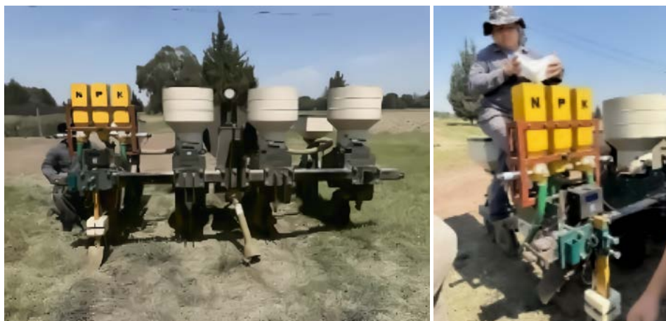
Figure 1. Installation of the variable doser in a seeding machine, 2023.

For the profitability estimation, data obtained from the assessment of the functionality of a variable rate doser and those from a conventional doser were utilized. These assessments were conducted in an experimental corn plot at the Experimental Field of Valle de México, Texcoco, State of Mexico. In this evaluation, a 0L Magnus 400 seed planter from the Dobladense brand was employed, equipped with both a conventional doser and a variable rate doser. The variable rate doser includes a sensor capable of assessing the nutritional requirements of the surface before applying the fertilizer.