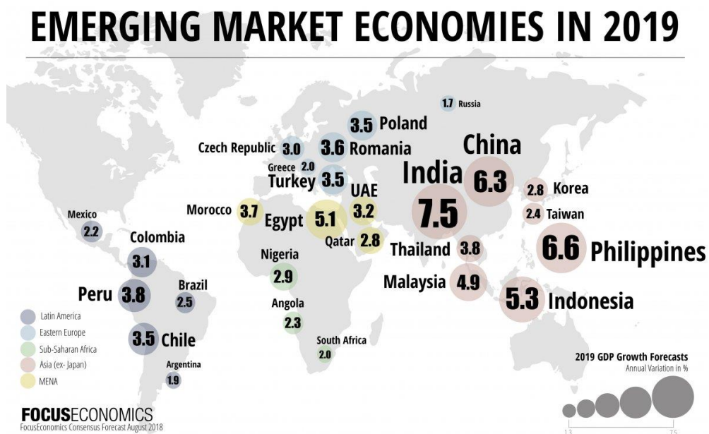
Figure 1: Emerging market economies in 2019

Emerging economies are defined as countries that adopt economic liberalization as the main engine for rapid economic growth and have institutional voids that increase the risk of doing business (Banalieva, Tihanyi, Devinney, & Pedersen, 2015). Emerging economies primarily refers to rapidly growing developing countries that are believed to soon be joining the group of developed countries. Based on their latest economic track records, emerging market economies in 2019 included the following countries: