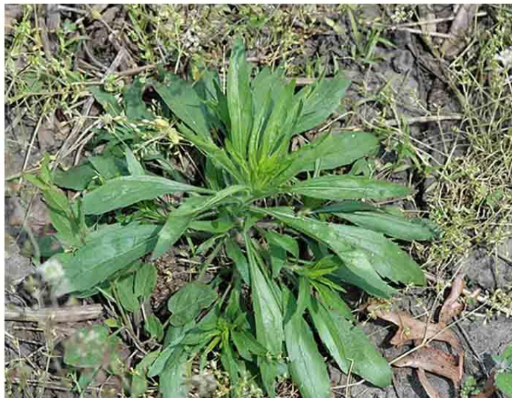
Figure 1. Young Horseweed Plant

We request all readers, electronic media and others follow our citation guidelines when re-posting articles from farmdoc daily. Guidelines are available here . The farmdoc daily website falls under University of Illinois copyright and intellectual property rights. For a detailed statement, please see the University of Illinois Copyright Information and Policies here .