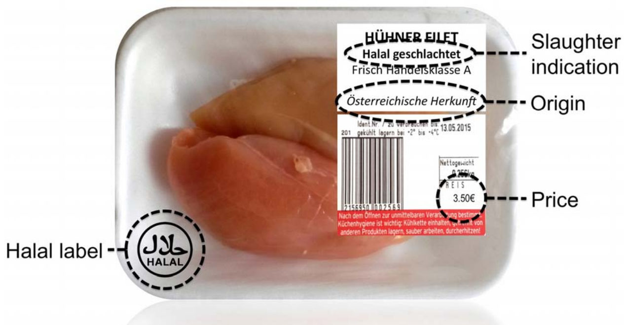
Figure 1. Stimulus card no. 4.