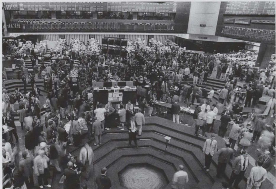
The strong economy of the mid to late 1990's, which featured a soaring stock market and low unemployment rates, helped lift incomes of many families and reduce food stamp rolls.

gram at least 20 hours per week, or lived in areas granted waivers because of high unemployment rates or insufficient number of jobs. A limited number of cases were exempted at the State's discretion. According to the General Accounting Office, the number of able-bodied adults without dependents participating in the Food Stamp Program dropped from about 1.1