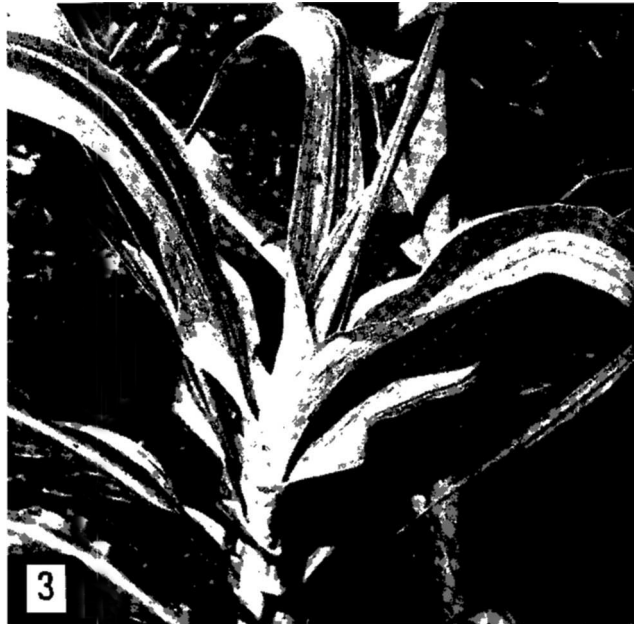
Fig 3 Maize plant infected, clear bands.