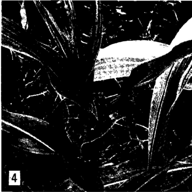
Fig 4 Stunting and deformation.