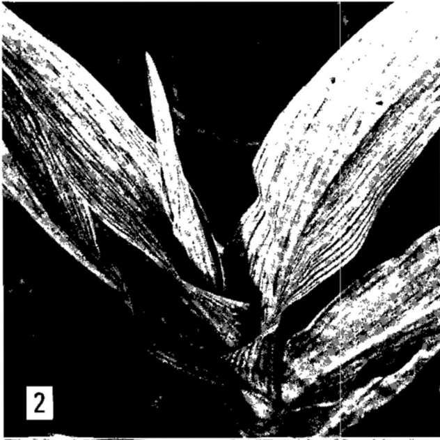
Fig 2 Maize plant infected, stripes irregular and discontinuous.