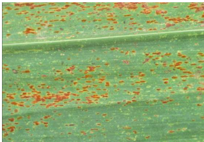
Figure 1. Orange rust symptoms on the lower surface of a sugarcane leaf. Note the bright orange coloration of the pustules containing urediniospores. Brown rust pustules (absent) are typically longer and darker brown in color. Yellow flecks are early infections that may produce open pustules given favorable conditions for sporulation.