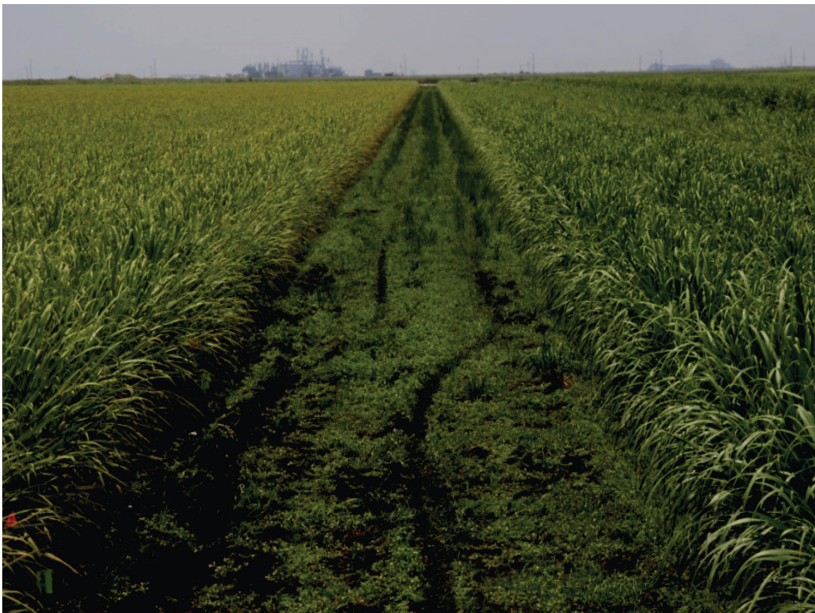
Figure 4. Two plantings of sugarcane showing significant differences with regard to varietal susceptibility to orange rust. The variety on the left is the moderately susceptible variety CP80-1743, while on the right is a highly resistant variety.