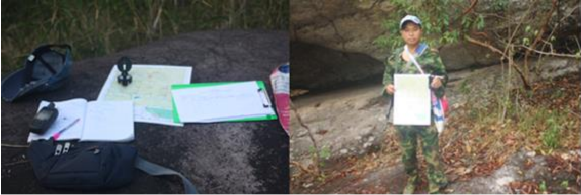
Picture 3: Equipment used for the Green Peafowl survey including GPS, geographic map, compass, and data form. At a listening post, a team laid out the map toward the north using a compass so that it allows them to locate and get compass bearing easily when hearing Green Peafowl calls.