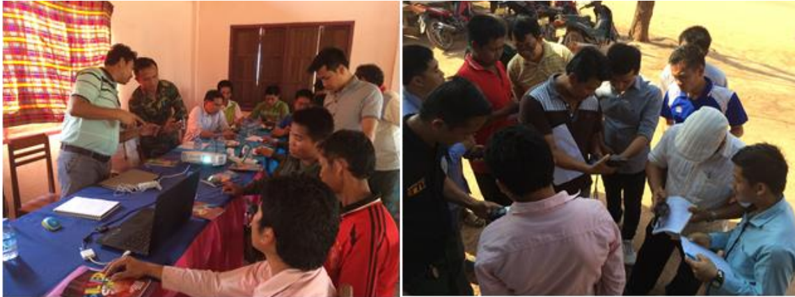
Picture 1: Participants learn and practice the use of GPS and data forms during the training.

to do practical exercises in order to ensure that they understood the survey techniques, and the proper use of the necessary field survey tools, such as GPS, geographic maps, compass, and data forms. Once everybody felt confident about the survey techniques and use of tools, participants were divided into six teams of two people (one military staff and one villager), were assigned to a target survey area and received all the necessary survey equipment.