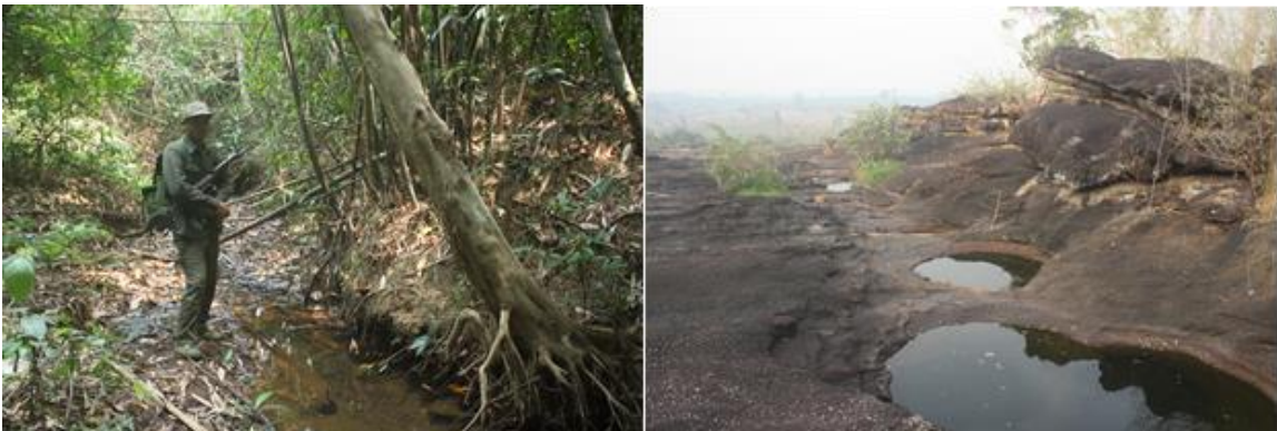
Picture 4: A team member in the field, visiting the water holes during daytime.