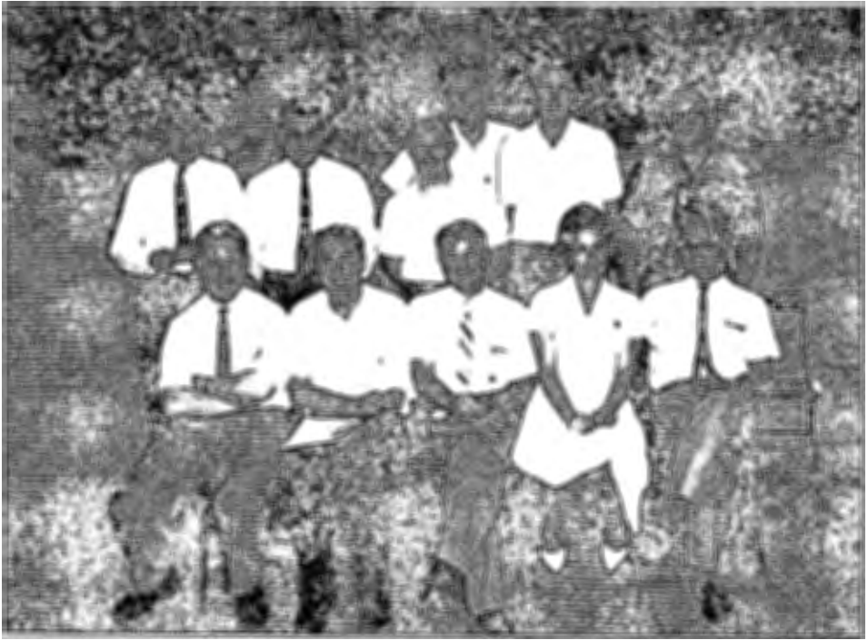
GROUP 11 (b). ANALYSIS AND USE OF AGRICULTURAL STATISTICS