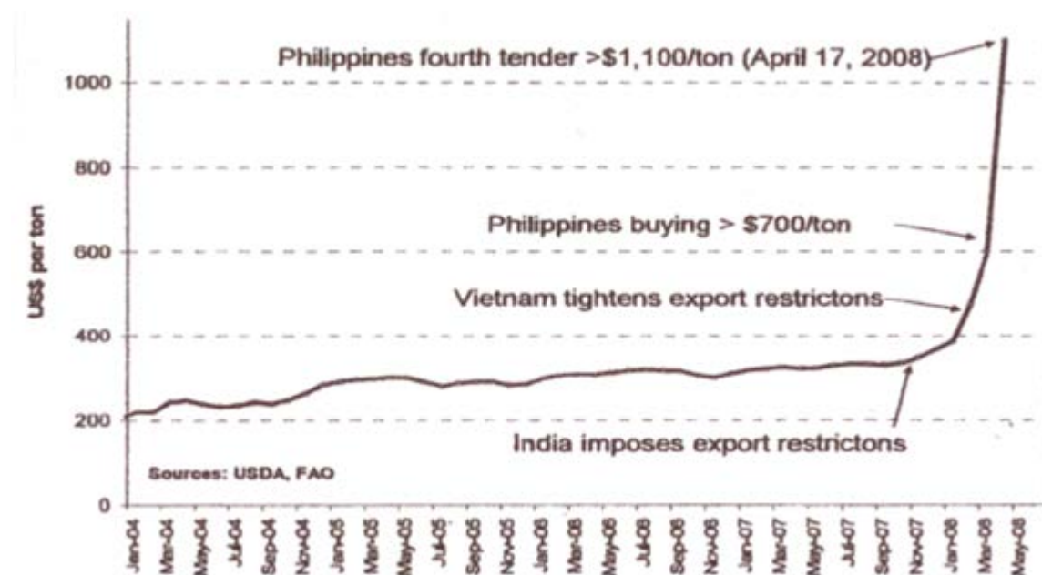
Figure 2. Rice Prices 2004-2008

The rapid rise in food prices represented not only a crisis in food prices for many governments, but also a food policy crisis. Case study authors use terms such as ad hoc, contradictory, confused, unprepared, and even being in a panic. Government actions and inactions sparked fierce debate and riots across the globe.