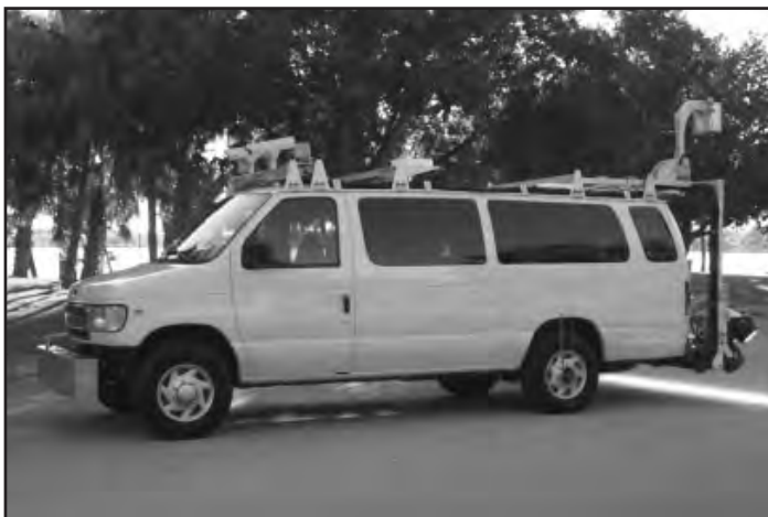
Figure 1: Automated Pavement Condition Survey Vehicle