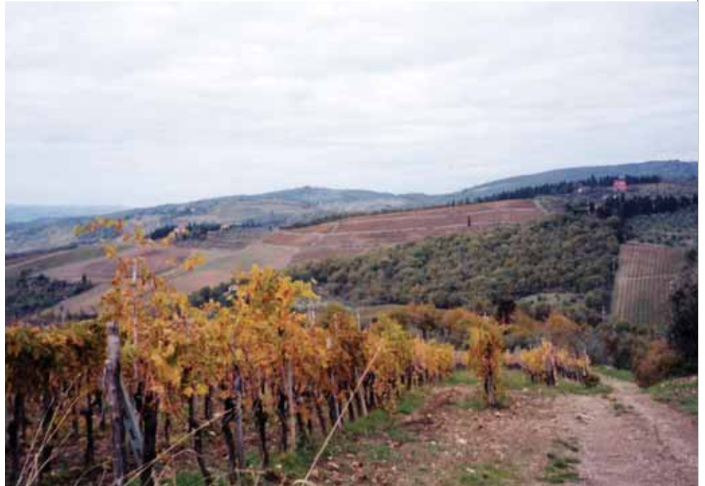
Mary Anne Normile, USDA/ERS

Will the latest CAP reform further enhance the EU's competitiveness in agricultural trade? Severing the link between producer payments and production of specific products will give EU producers greater flexibility, within limits, to produce those goods best suited for production and market conditions. Further cuts in support prices, along with the delinking of payments from production, represent a move toward greater market orientation that could improve competitiveness. Some marginal land is likely to go out of production, leading to some decrease in production and exports, and thus increase world