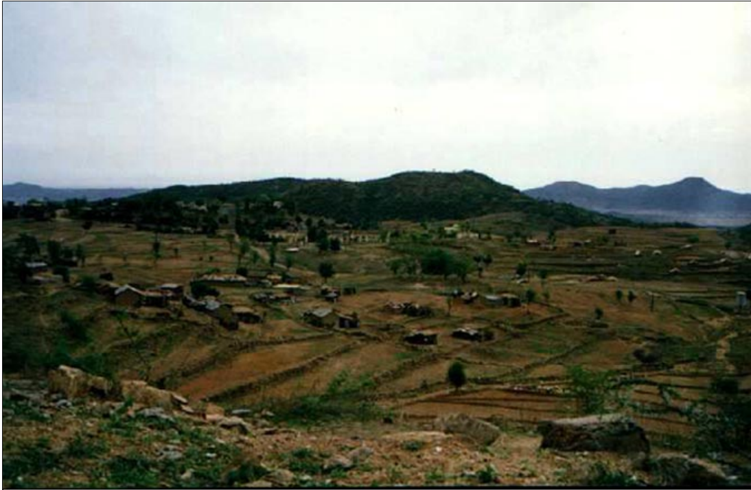
A view of the fields outside Dongollo Tahatai, at the eastern border of the Eritrean highland

Leasehold, which is reserved for investments and large public services, is available to both Eritrean nationals and foreigners, though the latter need specific permission granted by the president of the state. The immediate effect of that rule, however, was to curb the legal capacity of Eritreans living abroad in countries that had adopted the principle of reciprocity. That is, since foreigners living in Eritrea no longer had a legal capacity to own real estate (except with presidential permission), the same capacity was automatically denied to Eritrean nationals living abroad.