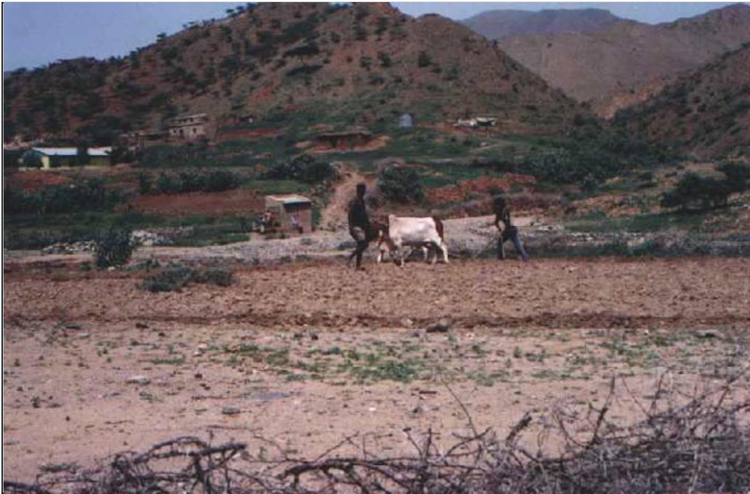
Peasant tilling land near Mai Habar, Eritrean highland

Rules adopted by the EPLF were generally based on a modern version of diesa , featuring the abolition of privileged groups and a wider entitlement of women to land. Moreover, compensation for improvements made between land distributions became widespread (the ambiguity of customary law on the issue had prevented peasants from making long-term investments, since they had no security of title to the specific plot).