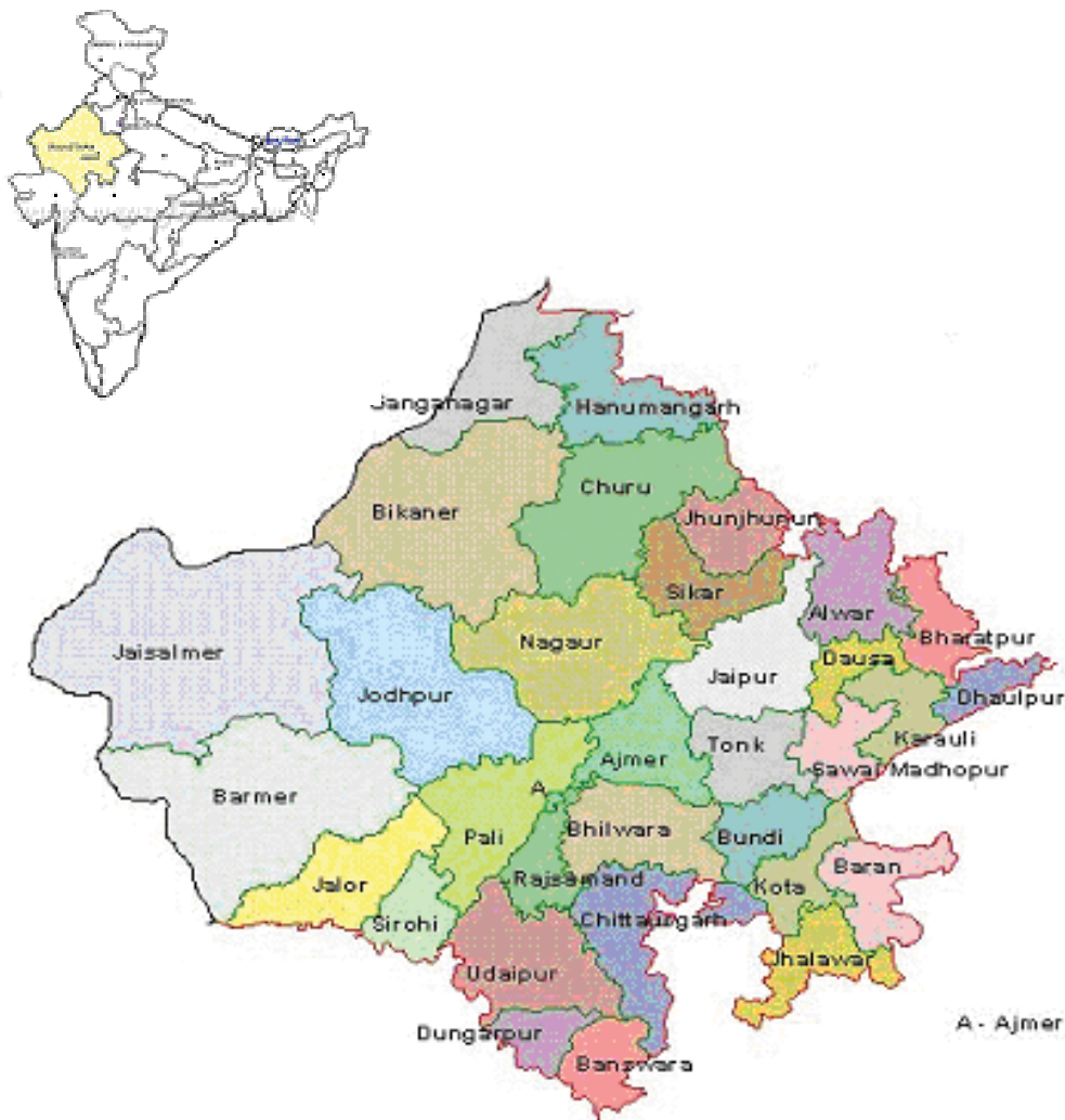
Figure 1 Geographical location and administrative subdivision of the Rajasthan State in 2001.

For historical and geographical reasons, the State remains socially and economically backward. Recurrent drought a poor resource base for economic development, the highest cost of development per capita due to aridity and very low density of population, low level of literacy (particularly among women), a very high rate of population growth and scarcity of water make the task of socio-economic development a challenge compared to many other States in the country. The climate of Rajasthan State varies from arid to sub-humid.