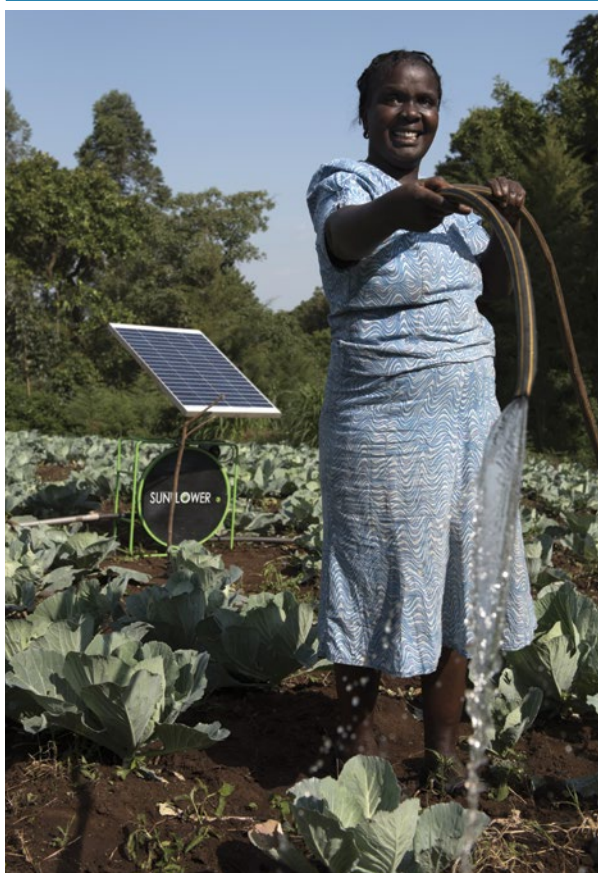
FIG. 2: SOLAR IRRIGATION IN AFRICA

Investments in smallholder ALWM are transforming food security and livelihoods in Asia and Africa. The scale of current investments by smallholders is astonishing, and the potential in terms of benefits