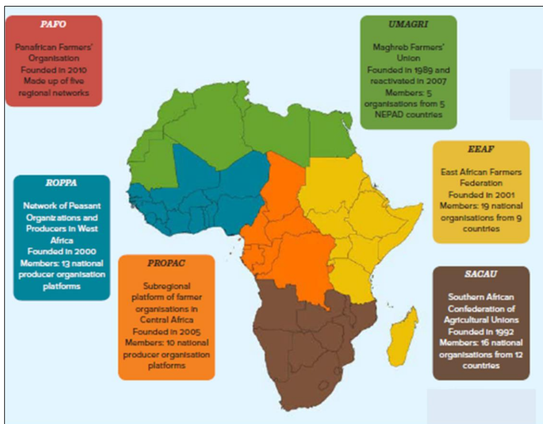
Figure 1: Members of the Continental and Regional FOs in Africa