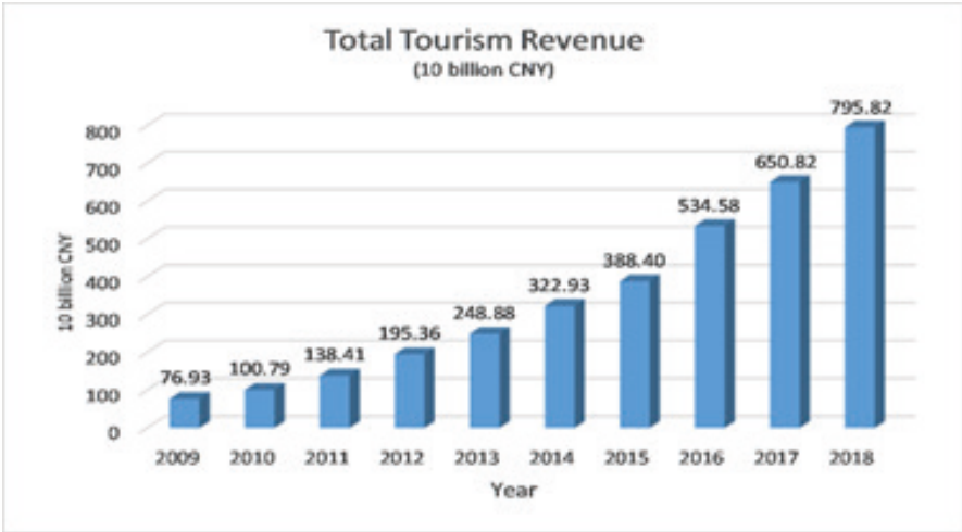
Table 1. Total Tourism Revenue from 2009 to 2018 Source: Dali City Statistical Yearbook (DCBS2009-2018)

The beautiful natural scenery, many historical and cultural monuments, rich ancient customs in Dali to become the Yunnan province tourism industry started one of the first region. Since 1980s to late 1990s, Dali tourism industry has been rapid development, has become a popular tourist destination in Yunnan province city.