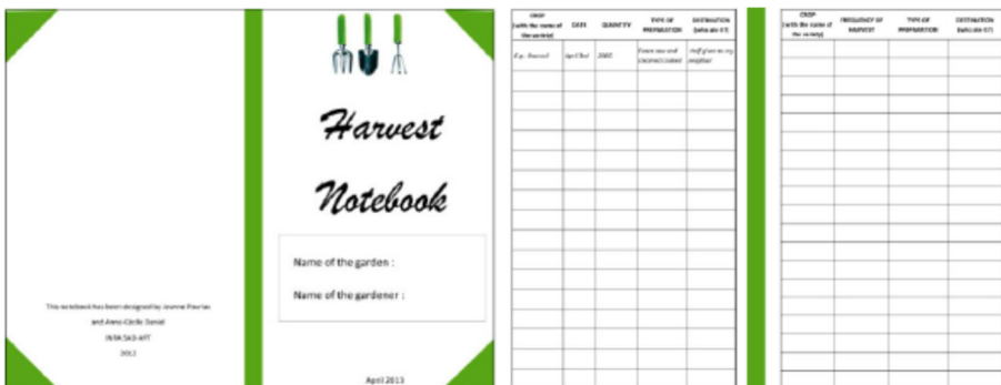
Fig. 2 Harvest Booklet: Front and Back Covers and Inside Pages (Pourias et al. 2015)

Gardeners from nine different selected allotments were followed with the harvest booklets in order to characterize their production, practices, and risk perception. Gardeners from these nine selected plots (14 individual gardeners) were individually interviewed from 2011 to 2015, and each gardener was interviewed twice during the growing season. At the beginning of the growing season, a semi-structured individual interview was held regarding his or her point of view on the importance of the food function of his or her plot (importance of the garden in the gardener’s overall food supply, use, and destination of the produce, etc.). At the end of the growing season, a second interview was held to assess the gardening practices (nature of the soil amendments and treatments such as copper foliar addition) and their level of concern about arsenic pollution. For that point, the following questions were asked: (1) Do you know the situation with water quality in the gardens? (2) Are you interested to read the study performed by the students from the University on that subject? (3) Do you have questions on that subject? (4) What is your opinion on the management of the arsenic pollution? And (5) do you want to discuss a particular point concerning your gardening activity? In addition, several meetings of the association and with the city hall helped to complete the individual analysis of how the association became more organized to deal