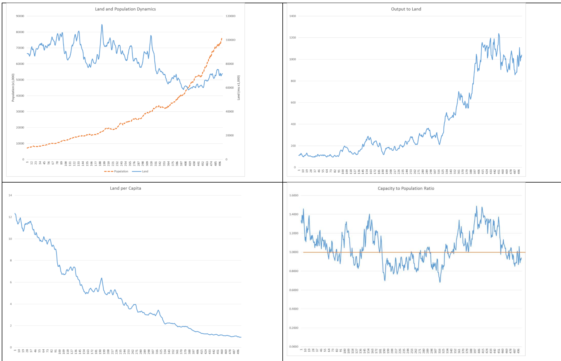
Figure 0-3: Fractional Poverty Trap Dynamics showing possible path over 500 years with Land and Population, upper left; Output to Land on upper right; Land per Capita, lower left; and Capacity to Population Ratio, Lower right. Start and endpoints differ from observed population and land use in China in 1900. In this scenario large gains in output due to technological innovation reduce the need to cultivate lower quality land, while providing sufficient capacity for population growth. Poverty trap dynamics illustrated in lower right, where excursions below values of 1 indicate below subsistence living standards. Here we observe an excursion pattern that oscillates about the subsistence line.