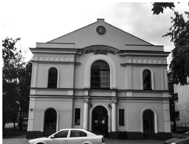
Figure 1. Building of the Bekesi Szilvapalinka Centrum.

Arpad Palinka Tanya: A distilling plant in the northern part of Bekescsaba, operating for more than 10 years. Young entrepreneurs safeguard its expansion in terms of product range and services based on their knowledge and experience learnt from their fathers in the framework of the newly established Kisret Manufactory Ltd. It includes a tasting and exhibition facility with a seating capacity of 24 where they can showcase their own premium palinka products and touristic program packages.