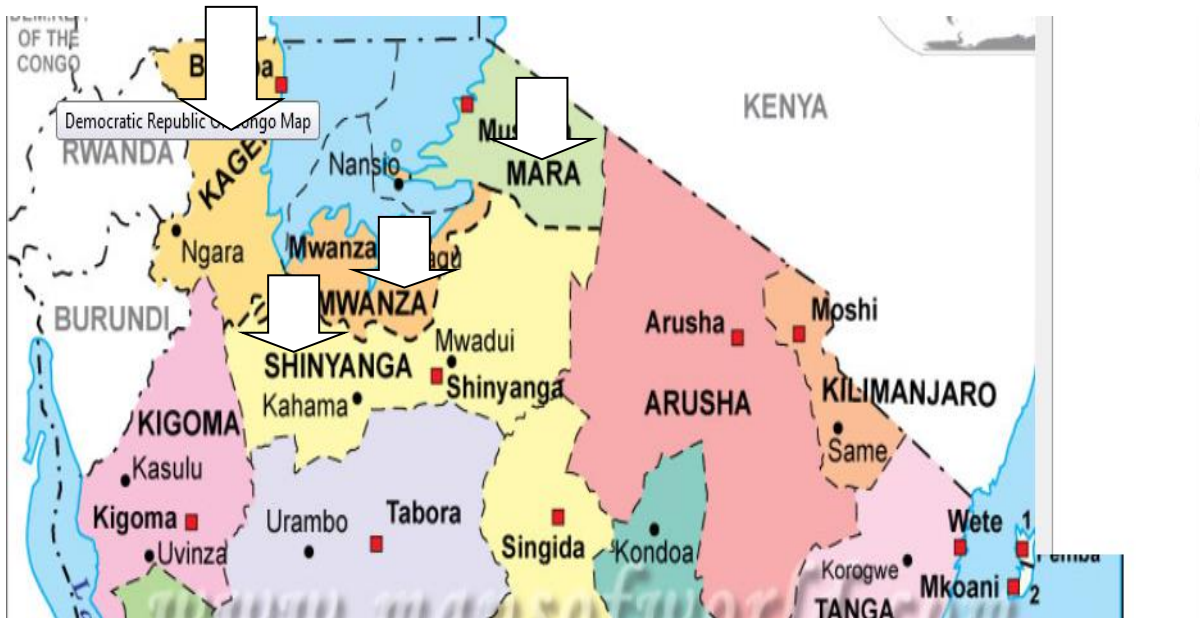
Figure 1: A map displaying the area of study