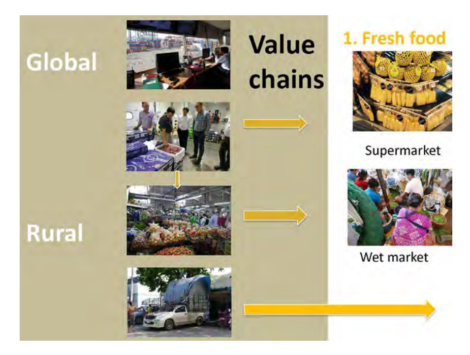
Figure 2. Aspects of supply chains for fresh food, observed in Thailand.

photo in Figure 2 shows the type of truck that would carry these grapes, which had arrived by first class delivery from Australia. This truck was probably going to take them to Cambodia – hundreds of kilometres in tropical heat.