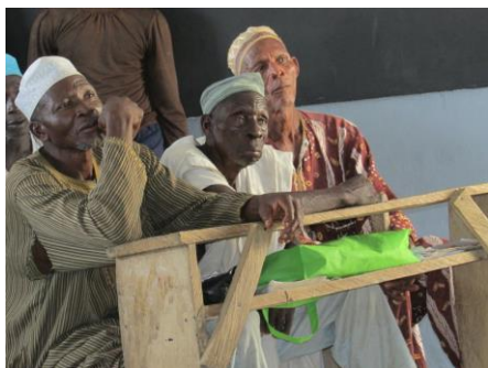
Farmers attending a video projection training session about Urea Deep Placement technology for rice production in Ilorin, Kwara State, Nigeria; July 2014

Increasing the use of modern inputs including fertilizer is key for raising agricultural productivity and reducing poverty in Nigeria, particularly and Africa more generally. However, based on recent empirical evidence from Nigeria, simply increasing the quantity of fertilizer used by smallholders is not likely to successfully drive this process. A more holistic approach that addresses the constraints to fertilizer profitability in Nigeria with appropriate consideration of the factors which will increase the efficiency of fertilizer use is necessary. This includes proper attention to soil characteristics and organic matter content, attention to ways of increasing farmer access to and use of good quality complementary inputs such as improved seeds, machines and irrigation as well