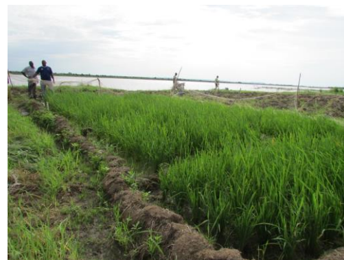
Farmer managed demonstration plot showing a striking difference between parcel cultivated with UDP (on right) and parcel cultivated without UDP (on left) in Ilorin, Kwara State, Nigeria; July 2014; Photo Credit: Serge Adjognon

In Nigeria, there are several laboratories that can handle soil analysis. Most agricultural research institutes and soil sub-sections of the departments of agronomy in Nigerian Universities will undertake routine soil analysis.