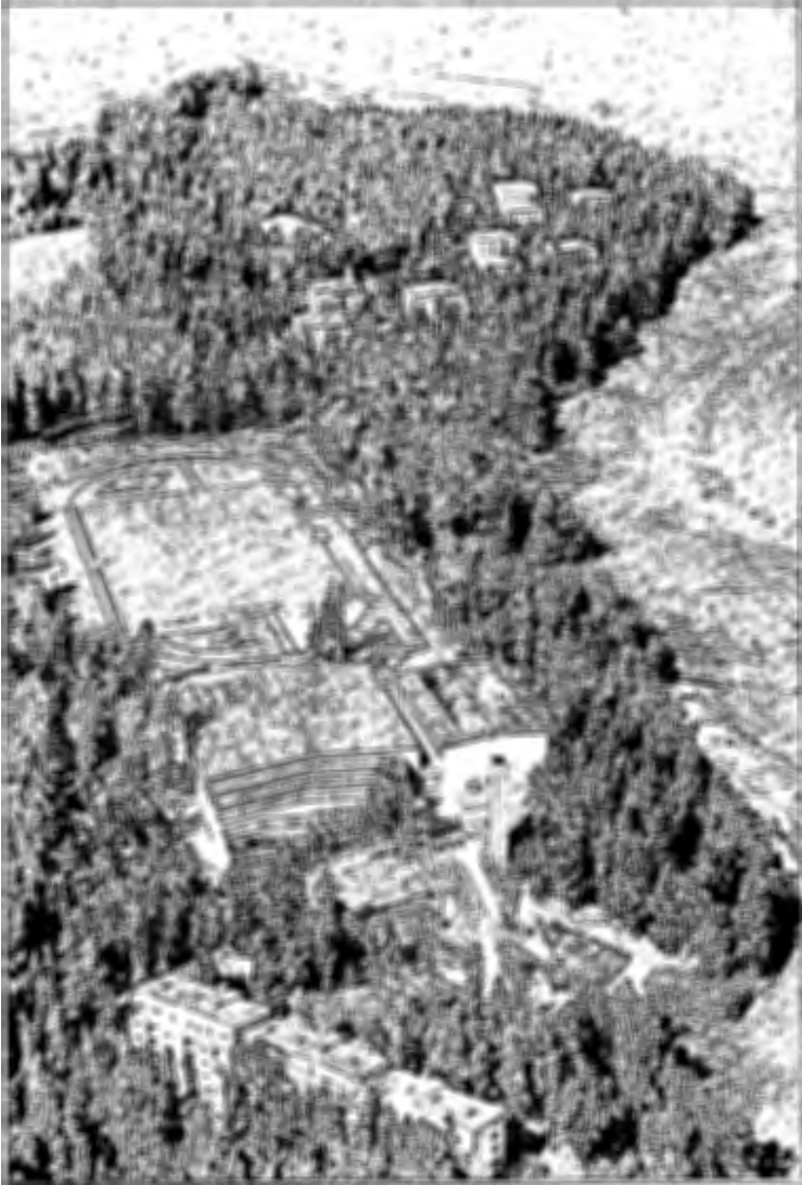
TEEKKARIKYLA, OTANIEMI, FINLAND