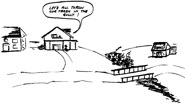
SCENE II. INDIVIDUAL DECISION — AGGREGATE

Scene III shows a setting with more houses and more people. It is no longer possible just to throw the trash in the gully. This stage of development has spawned a problem greater than can be solved by individual decisions. The group permissive decision allows the community to contract to have " Sam haul away our trash! " Each home owner has the opportunity to participate for a fee of perhaps $2.00 per month. While participation is voluntary, there may be some arm twisting if Joe's yard begins to look or smell too bad.