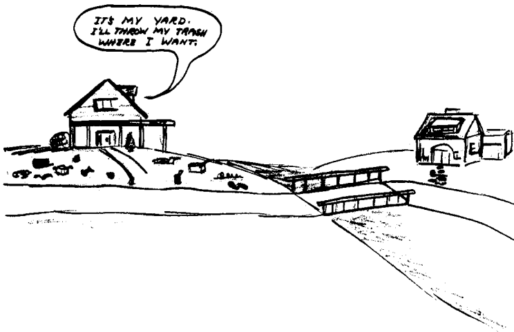
SCENE I. INDIVIDUAL DECISION — PERSONAL

Scene I shows a yard littered with trash as a result of Joe's personal decision, " It's my yard, I'll throw my trash where I want! " The individual is exercising his right to make a personal decision.