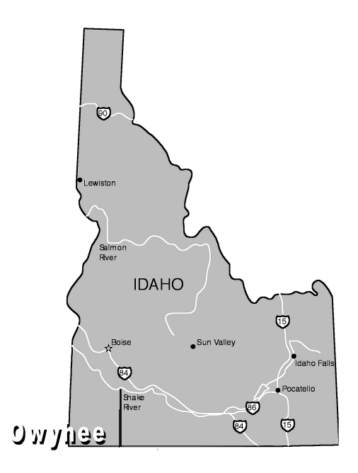
Figure 1. Location of Owyhee County, ID.

Ranch cost-and-return estimates were obtained using a series of four producer panels in Owyhee County. Panel members were identified through the County Extension faculty, BLM permittee lists, and the local livestock association. Invitations were mailed with background material prior to the scheduled meetings. Four sessions were held during May and June 1998 at Pleasant Valley School near Jordan Valley, Oregon, and Marsing, Bruneau, and Three Creek, Idaho. At the scheduled meetings, input was solicited about ranch resources (feed, labor, land, and equipment), livestock classes, sale weights and numbers, and operating procedures (veterinary program, production practices, and marketing procedures), along with potential adjustments to the operations