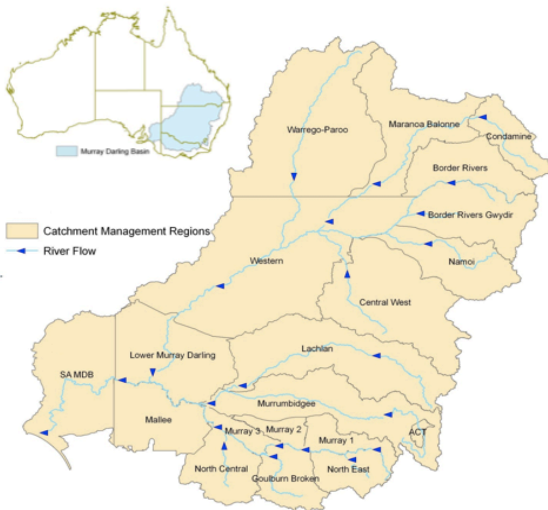
Figure 1: Murray–Darling Basin, Australia

Annual inflows into the Basin since the 1890s have averaged 27 000 GL, of which runoff into streams contributed about 25 000 GL, accessions to groundwater