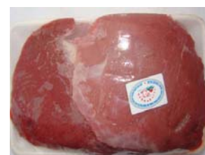
Label for H'mong beef

It is difficult to calculate the economic effects of the activities for over 100 households. A real case can be