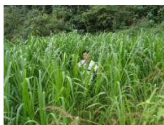
H4. Grass on the mountain valley