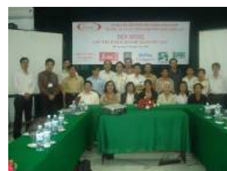
H6. Stakeholder workshop