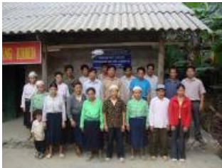
Launching a new interest group