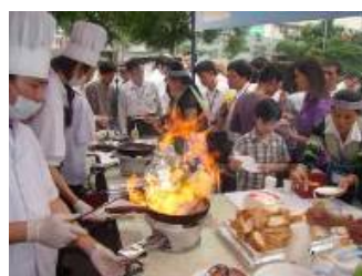
H5. Tasting event on 25/4/09

At the present, the 4 interest groups can supply 100kg/week. This volume can only meet 20% of Big C purchase of domestic beef.