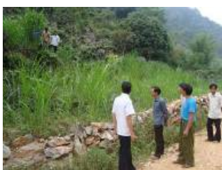
H3. VA-06 grass

The group farmers are able to make plans and implement them with the consultation and monitoring of the relevant experts and the local veterinarian of the commune and district. Poor households participating in grass cultivation and feed fermentation have good awareness and responsibility in experience sharing, i.e. transferring of grass seeds to other households. Besides, the group households are very active in vaccination.