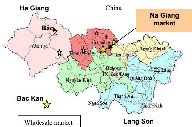
Figure 2 – Map of cattle wholesale markets in Cao Bang

H'mong beef is sold at 2.5% higher price per kilo after slaughtering, compared to yellow-cattle origin beef (1000 - 2000 dong per kilo of beef after slaughtering)