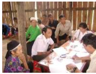
A planning meeting