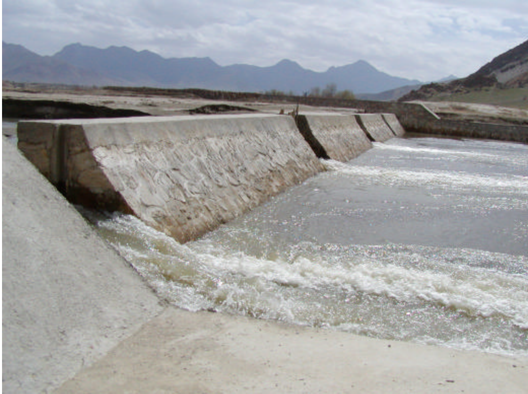
Figure 4. New Dam on the Logar River.