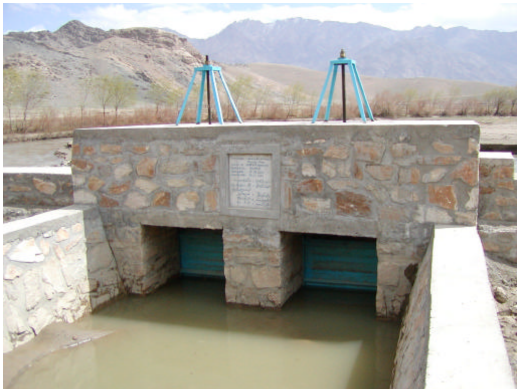
Figure 5. A typical gate fitted canal intake.