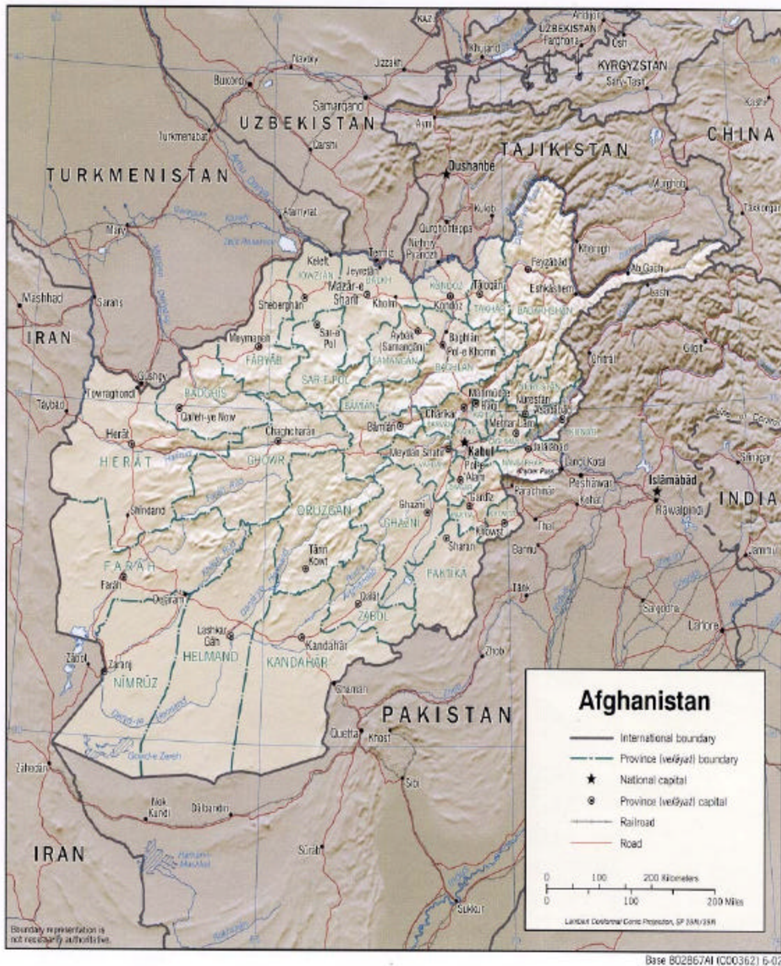
Figure 1. Map of Afghanistan showing its location in the region