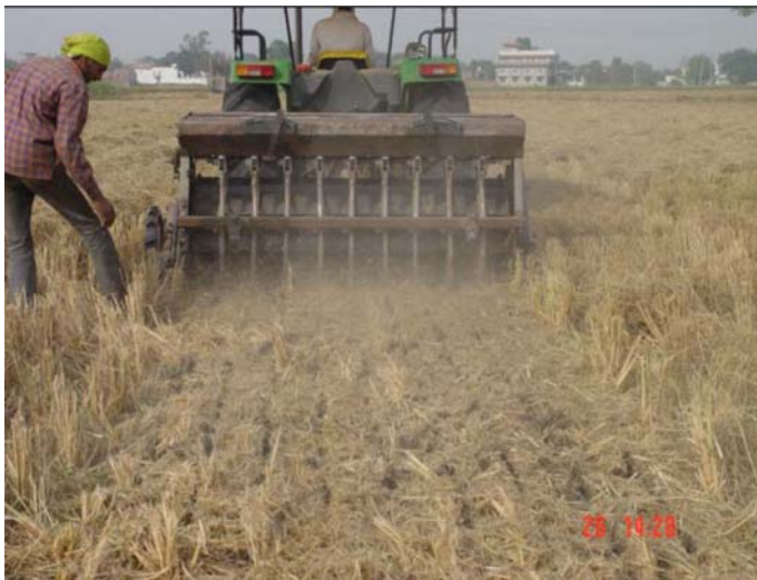
Figure 5. Turbo Happy Seeder

Initial trials of the Turbo HS in 2005/06 sowing wheat into rice stubble showed excellent establishment. However, the Turbo HS has not yet undergone full evaluation and is currently being tested in terms of stubble handling performance, power requirements, and crop performance in a range of conditions (stubble load, moisture, soil).