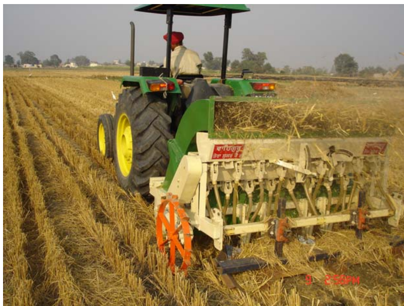
Figure 4: The Combo+ Happy Seeder

A second generation of the HS called the Combo + model was developed in 2004 by combining the forage harvester and seed drill into a single, compact, light weight (540 kg), 2 metre wide machine which can be easily mounted on a three point linkage (Figure 4). A narrow strip tillage assembly was added in front of the sowing tynes to improve seed/soil contact on the sandy loam and loam soils in Punjab.