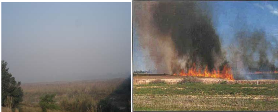
Fig 6 and 7: Air pollution from burning rice stubbles

The accidents cause loss of life and property, while the traffic delays waste time and fuel, increase transportation costs and create additional pollution from idling engines. It has been estimated that poor visibility due to smoke from stubble burning leads to 20% extra travel time (Personal communication, Assistant District Transport Officer, Sangrur, Punjab). Punjab has a total road length of around 55,000 km with more than more than 3,511 buses travelling about 1.05 million km per day plus 400,000 tractors, 100,000 trucks, 330,000 cars and 3 million scooters (Government of Punjab, 2005), so reduction in traffic delays could have significant financial and economic benefits as well as lifestyle benefits.