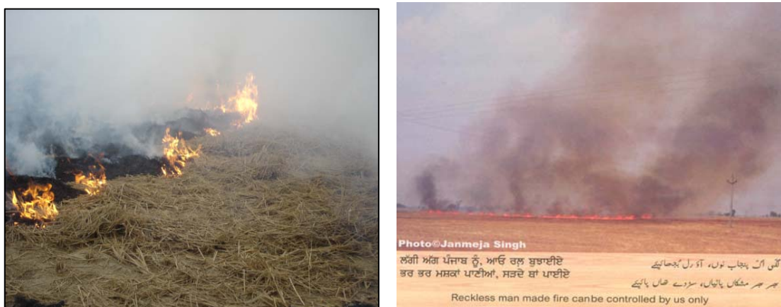
Fig 1 & 2: Burning of rice residues causing air pollution in Punjab

However, burning rice stubbles results in serious air pollution with adverse effects on human and animal health (Gupta and Sahai 2005, Lal 2006, Aggarwal 2006 and Canadian Lung Association 2007), and increased GHG emissions (Prasad 2006, Garg 2006). Burning also results in large loss of nutrients and organic matter (Table 1). After burning, the seedbed for wheat is typically prepared by 1 discing, 2 tyne harrowings and 2 planking (Appendix 1). Wheat is then sown using a tractor operated seed-fertiliser drill. However, zero tillage after stubble burning is now being adopted by many farmers. In 2005-06, around 10% of the total area sown to wheat was sown using zero till machines. Less than 1% of farmers incorporate the rice straw, perhaps because more tillage operations are required than after burning (Department of Agriculture, Punjab 2005).