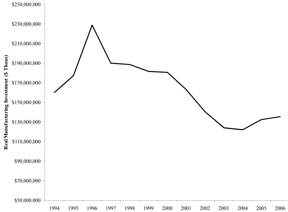
FIGURE 1. U.S. Manufacturing Investment