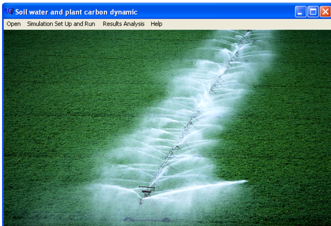
Figure 2 WATER-BIOMASS DYNAMIC main interface

The WATER-BIOMASS DYNAMIC provides a user friendly tool to help users design complex climate change scenarios. Figure 2 shows the interface of WATER-BIOMASS DYNAMIC. Users can design the climate change scenarios in the (set up and run) form by clicking the (simulation setup and run) menu (see Figure 3). On this climate change tool, users can specify the daily maximum or minimum temperature, daily rainfall changes and CO 2 changes.