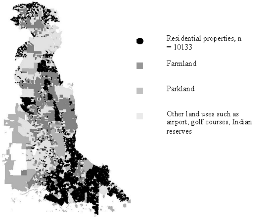
Figure 2: Land use and location of residential properties on the Saanich Peninsula