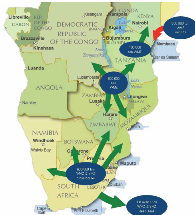
Figure 1. Cross-border maize market flows in Eastern and Southern Africa

Sahelian zones, trade across large distances to reach coastal urban markets (Figure 2), and significant cross-border flows of cereals percolate across the region, in both a north-south and an east-west direction.