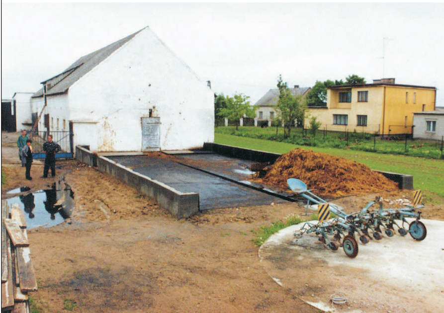
Figure 5: Manure Stored on Concrete Pad

In December 2001 the Lithuanian Environmental and Agricultural Ministries issued a joint order as part of the process of implementing the Nitrate Directive. The order specifies the maximum stocking density (1.7 LU/ha) and requires that farms with more than 10 LU (about one-fifth of all farms) must eventually have a six-month manure storage capacity. In the short term farms with more than 300 LU, as well as newly established farms, must establish manure storage facilities. Farms with more than 150 LU should establish storage facilities within four years following EU accession, and farms with more than 15 ha of arable land must prepare annual fertilization plans (Sileika, 2001). The remaining farms with more than 10 LU should carry out the necessary modernization of their manure storage, but the timetable is unspecified.