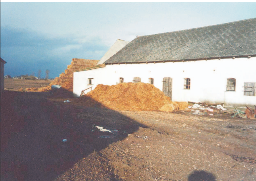
Figure 1: Animal Waste Stored on the Ground in Polish Countryside

The accession negotiations with the European Union (EU) have transformed the political status of the farm–pollution problem. Poland is required to implement the environmental acquis , including the Nitrate Directive. Water pollution from nitrates is no longer a concern only of experts. It has acquired wider political ramifications in the context of debates and negotiations about how to prepare Polish agriculture to participate in the Single Market. The need for and the practicalities of equipping farms with manure storage facilities – in order to comply with the Nitrate Directive – have become matters of considerable contention involving a range of organizations.