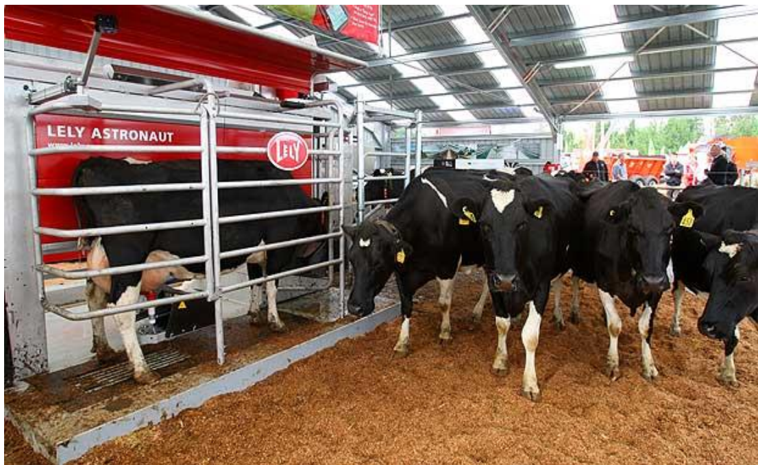
Figure 1: The first live demonstration of AMS technology in NZ

The following document looks to build on these ideas, and build on the conclusions and unanswered questions that have been put forward by the previous researchers of AMS’s role and potential within the NZ dairy industry. The document will explain a detailed outline of a proposed study to test the hypothesis that; - indoor-based AMS farm systems are more viable than pasture-based AMS farm systems . It is hoped that this research will lead to the NZ dairy industry being given some of the data that it desperately needs on AMS farm systems for future adoption of the technology.