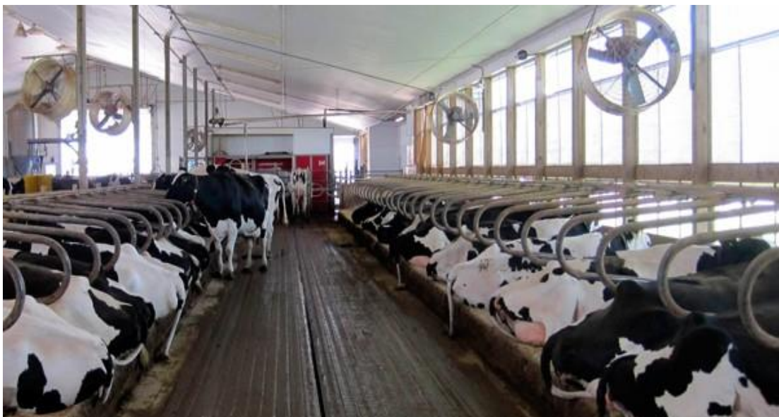
Figure 4: An international indoor-based AMS barn taken from Lely (2014)