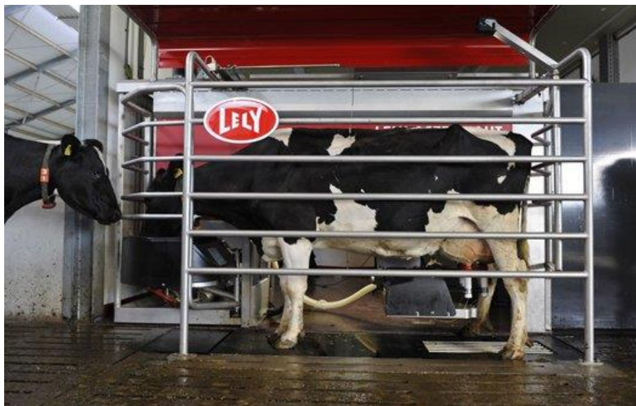
Figure 5: A cow being milked in a Lely Astronaut A4, taken from Team Lely (2013).

Therefore, the study should be based on the physical land resources of the Lincoln University Dairy Farm within the Selwyn—Waihora catchment of New Zealand. This area has been chosen as “the introduction of nutrient leaching limits on the scale proposed in the Selwyn Waihora catchment is unprecedented in New Zealand” (Environment Canterbury Regional Council, 2013, p. 36). As a part of this, the Lincoln University dairy farm will in the future have to meet a number of rules, which have been developed by the council for the Selwyn – Waihora Catchment.