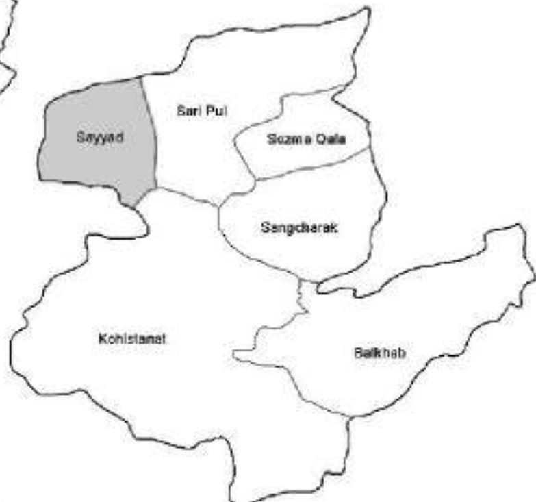
Map 8: Sayyad District, Saripul