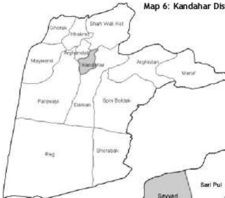
Map 6: Kandahar District, Kandahar