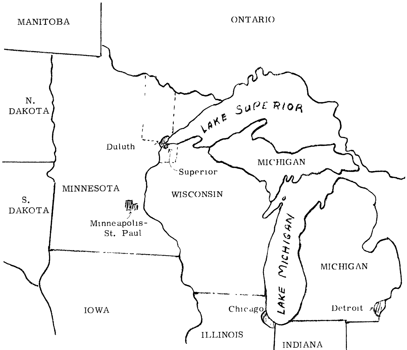
LOCATION OF DULUTH AND SUPERIOR IN MINNESOTA AND WISCONSIN

(Dotted lines enclose Duluth-Superior SMSA)